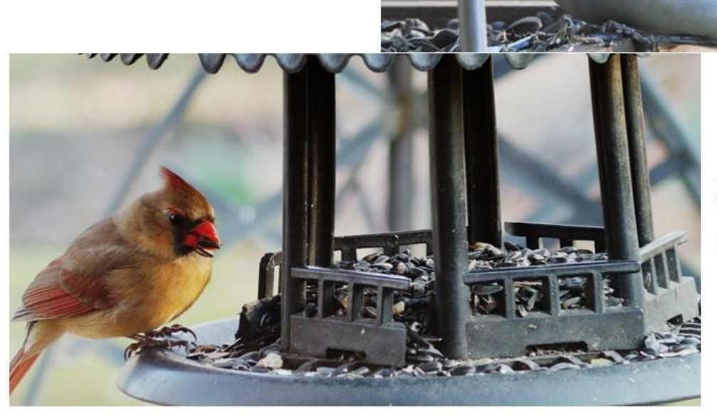
3rd Place Barb Moore