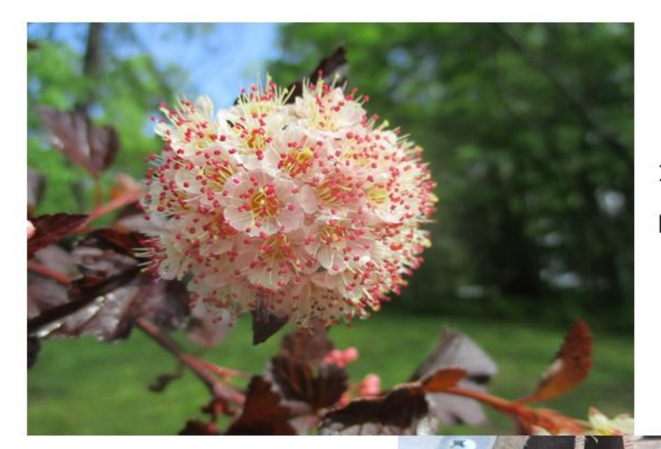
1st Place Barb Moore