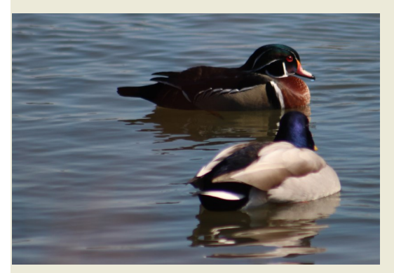
A native wood duck & mallard on a nearby pond.

If you'd like more information about the winter hay feeding technique described on page 1, let me know! I'd love to help you explore new ideas on your farm. Watch more about Bale Grazing here: <a href="https://bit.ly/BaleGrazingKY">https://bit.ly/BaleGrazingKY</a>